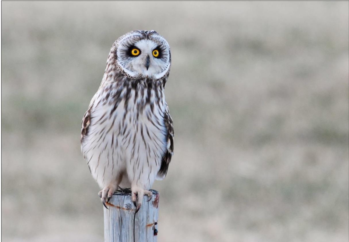
Short-eared owl in Finnmark, northern Norway. Tracking data would be beneficial to map nomadic movements of this species, and to establish more accurate estimates of the Fennoscandian population size.

The Norwegian population was suggested to number 1 000-10 000 breeding pairs in the period 1990-2003, and fluctuates according to rodent populations (BirdLife International 2004). The same population estimate was published in Gjershaug et al. (1994). However, there is no quantitative data to support this, and the upper limit of this estimate is likely to be too high. This is supported by a smaller Swedish population, estimated to 1,700 pairs in 2012, with an interval of 755-4 702 pairs. The Swedish population has declined during the past 30 years (Ottosson et al. 2012). The species can be found breeding in most parts of Norway, but is generally most numerous in mountain areas in the northern and middle parts of the country. Short-eared owls are rarely found breeding in Hordaland, Oslo & Akershus, Østfold and Vestfold (Sonerud 1994c).