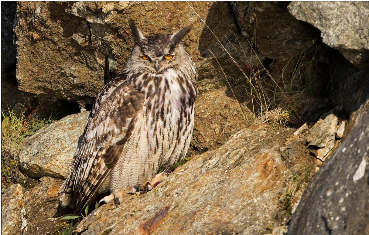
Eagle owl at nesting site in Lurøy, Nordland. The species has undergone serious population declines in Norway throughout the 20 th century, which is the reason why it is listed as “Endangered” on the most recent Norwegian Red List.

Human disturbance, e. g. associated with holiday cabins is an increasing problem, due to the eagle owl’s shyness and vulnerability at the nestsite. Cabins must be avoided within 1,000 meters from the nearest breeding location. It is also preferable to avoid logging activities within 50 meters from the foot of eagle owl breeding cliffs, and logging within 1,000 meters should be carried out only in September-January. Other relevant measures include restoration and protection of important habitats and nesting sites, and proper management of important eagle