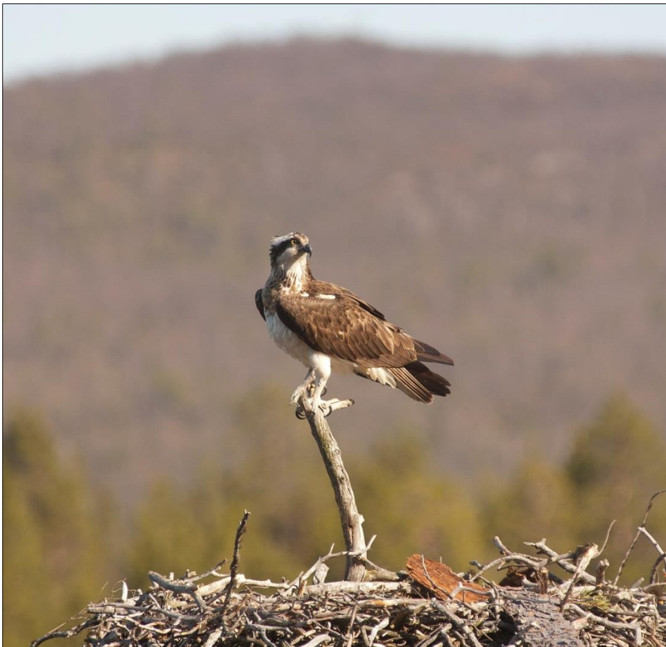
Osprey at nesting site in Finnmark. As in many other parts of Europe, the Norwegian population size is increasing.