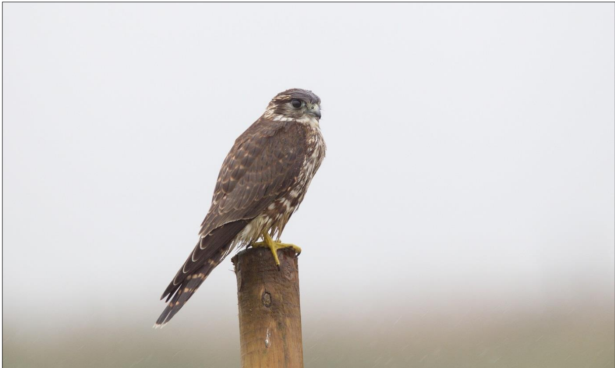
Merlin. The species is vulnerable to pollution in the winter quarters, probably due to its terrestrial prey.

Investigations are needed to get a more precise estimate of the population size and trend in Norway. Further studies are also necessary to find out more about migration routes and winter quarters for Norwegian merlins.