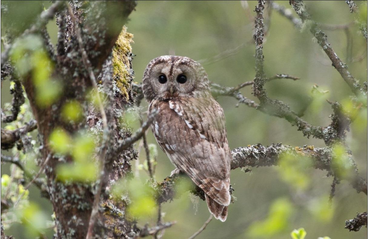
Female tawny owl at nesting site in Nord-Trøndelag. By 2013, more than 350 nestboxes have been erected for the species in the Trøndelag counties.