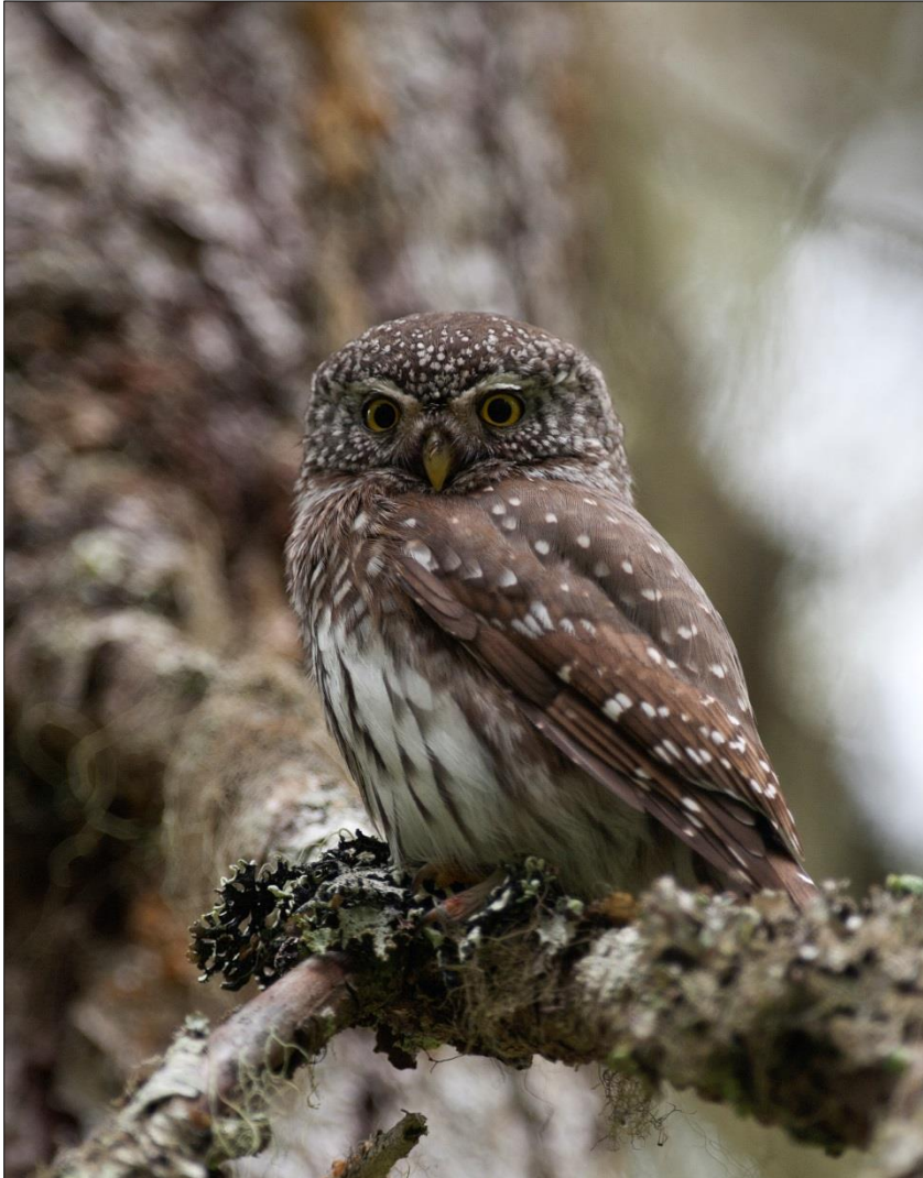
Adult male pygmy owl near nest site in Nord-Trøndelag Mid-Norway. The species' hoarding habits have been investigated both in Hedmark and Trøndelag.