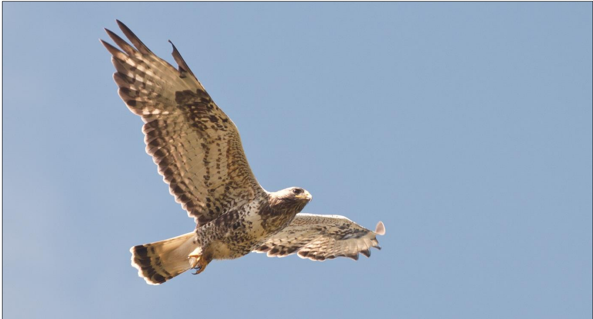
Male rough-legged buzzard at nesting site in Finnmark, North-Norway. The Scandinavian population size is probably decreasing, but data is lacking in Norway.

As nests may be built in cliffs in forest areas, and sometimes in trees, forestry may pose a threat. Nests are usually used repeatedly. The threat can be reduced if nests are located and protected prior to such activities. Søgne (2011) suggested the following: Avoid forestry within a distance of 50 m from the nest. If nests are located on large cliffs, forestry should be avoided within a distance of 50 m to each side and 25 m from the foot of the cliff. In addition there should be no disturbance within a distance of 200 m from the nest during the breeding season (March-August). Within these limits, there should be no forestry operation less than five years after the last breeding record. NOF-BirdLife Norway considers this as minimum measures.