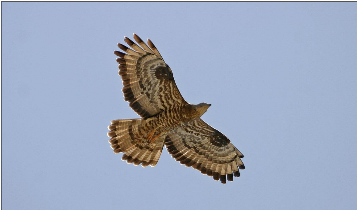
Honey buzzard on migration at Falsterbo, Sweden. More research is needed to establish a more accurate estimate of the population size for this red listed species in Norway.

Threats include deforestation, urbanisation and use of pesticides on the wintering grounds. A significant proportion of Fennoscandian honey buzzards are shot during their migration, especially in the Mediterranean area (Knoff et al. 2005). These problems are difficult to solve, but further mapping of migration routes and wintering areas, e. g. by the use of geolocators, transmitters or loggers, may provide the basis for further measures in this regard.