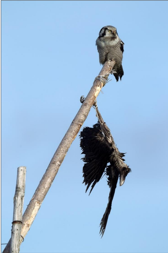
Adult northern hawk owl at Røst archipelago, Nordland, during irruption in autumn 2013. Investigations of regional movements are needed to better estimate the Fennoscandian population of this species.

distribution according to prey abundance and variations in climate are also needed to predict future prospects.