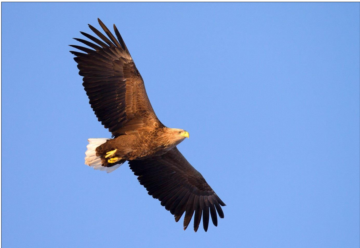
Adult white-tailed eagle in Finnmark, northern Norway. The Norwegian population of this species is by far the biggest in Europe.

Wind turbines have been shown to pose a threat to Norwegian white-tailed eagles. To avoid mortality of eagles caused by wind turbines, it is important to carry out proper environmental impact assessments before building of windfarms, to avoid the most important breeding areas, feeding areas and roosting areas. At identified sites and when eagles are especially vulnerable during certain periods of the year, temporarily closing down of wind turbines should be considered.