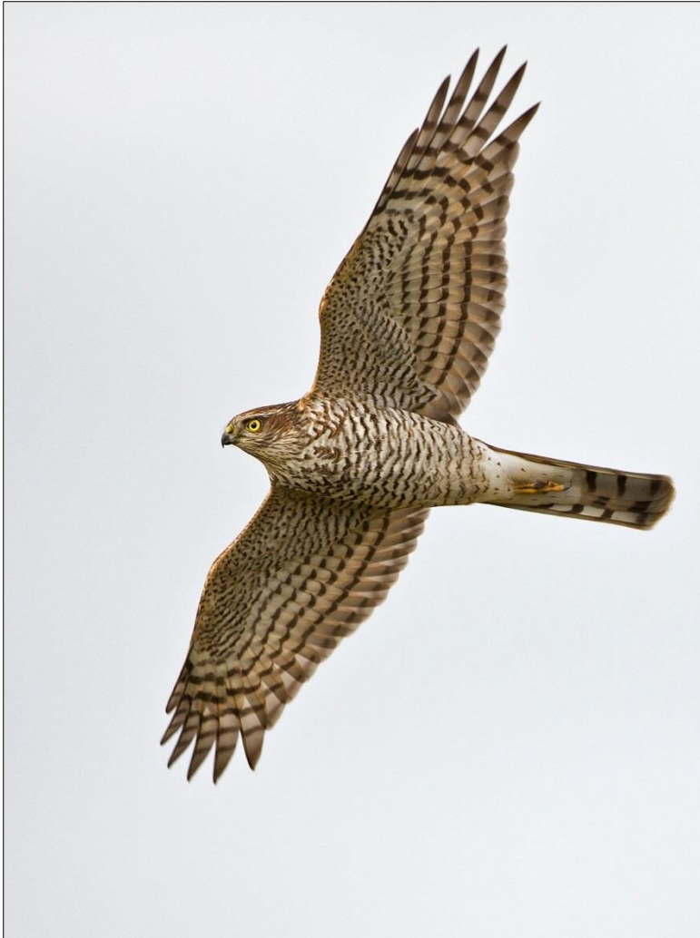
Eurasian sparrowhawk on migration, Falsterbo, southern Sweden. The sparrowhawk is one of the most common birds of prey species in Norway, and the population is probably increasing.