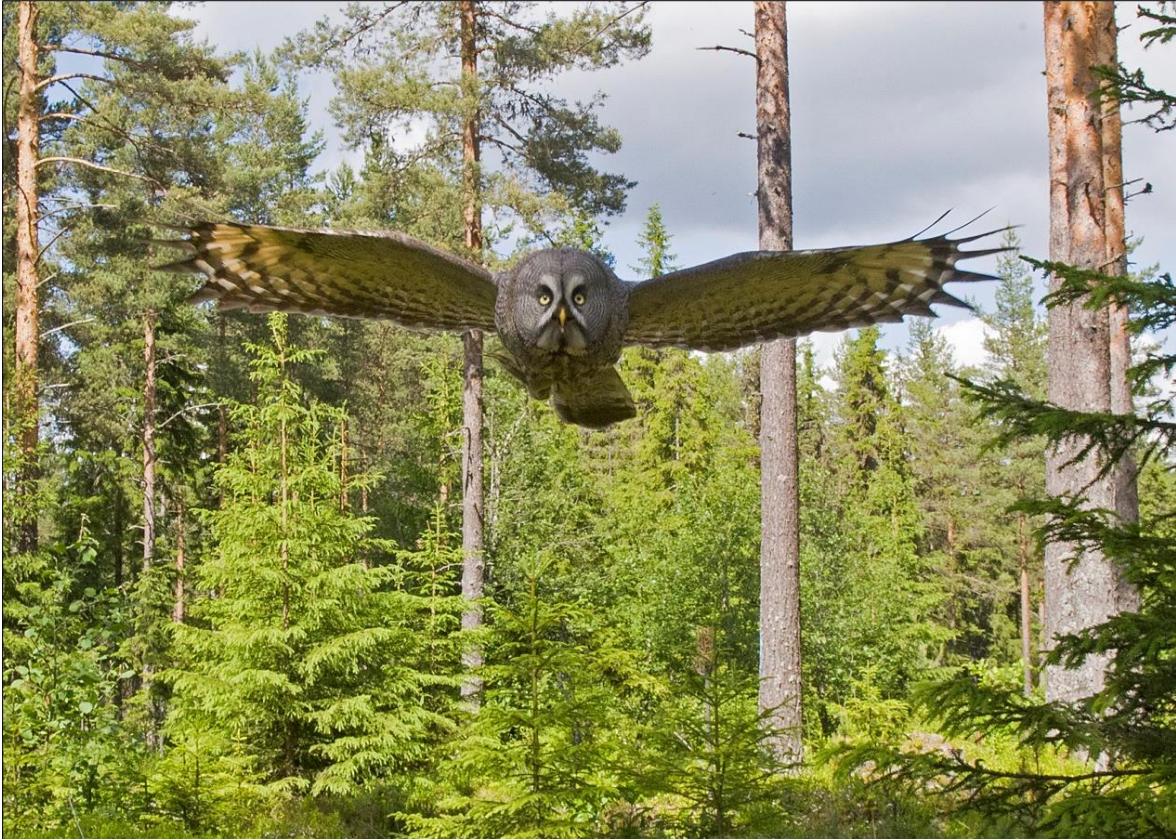
Female great grey owl attacking at nest in Hedmark when owlets are ringed. Protecting raptor nests and erection of artificial nests would help the species establish in Norway.