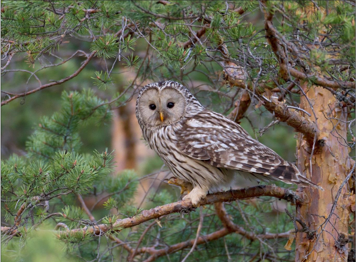
Ural owl at breeding site in Hedmark. More than 450 nestboxes have been erected for the species in the border areas between Hedmark in Norway, and Värmland and Dalarna in Sweden. Ten Ural owls were breeding in Hedmark in 2013.