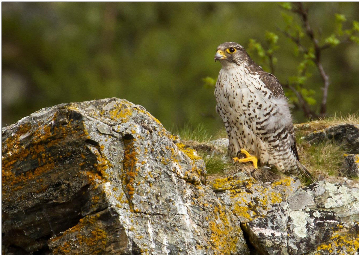
Gyrfalcon at breeding site in Finnmark, northern Norway. Reducing harvest of ptarmigans from 30% to 15% of August populations would be beneficial for the species.